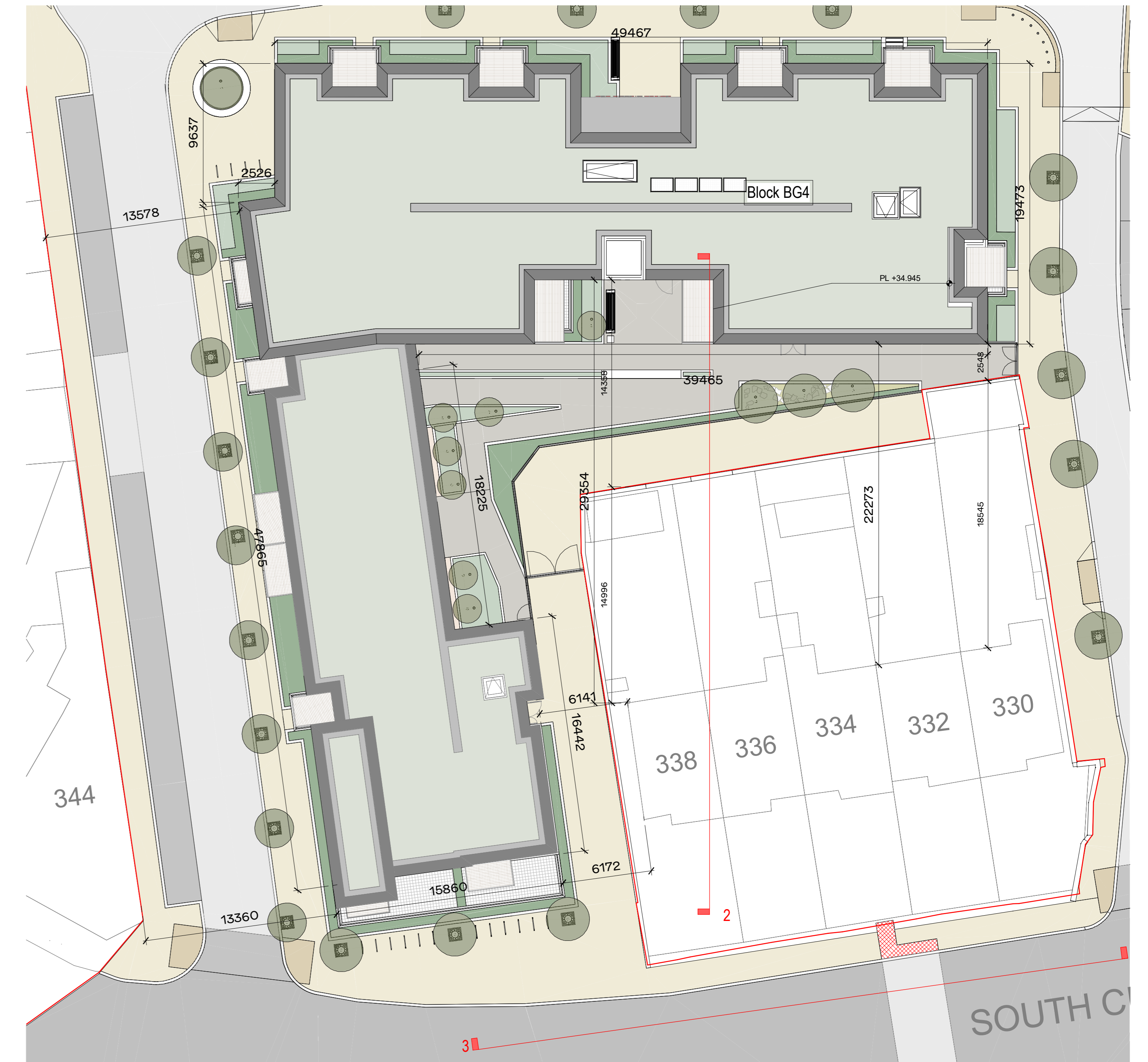
1 1 200 Roof Plan - Boundary Condition_02 1 : 200