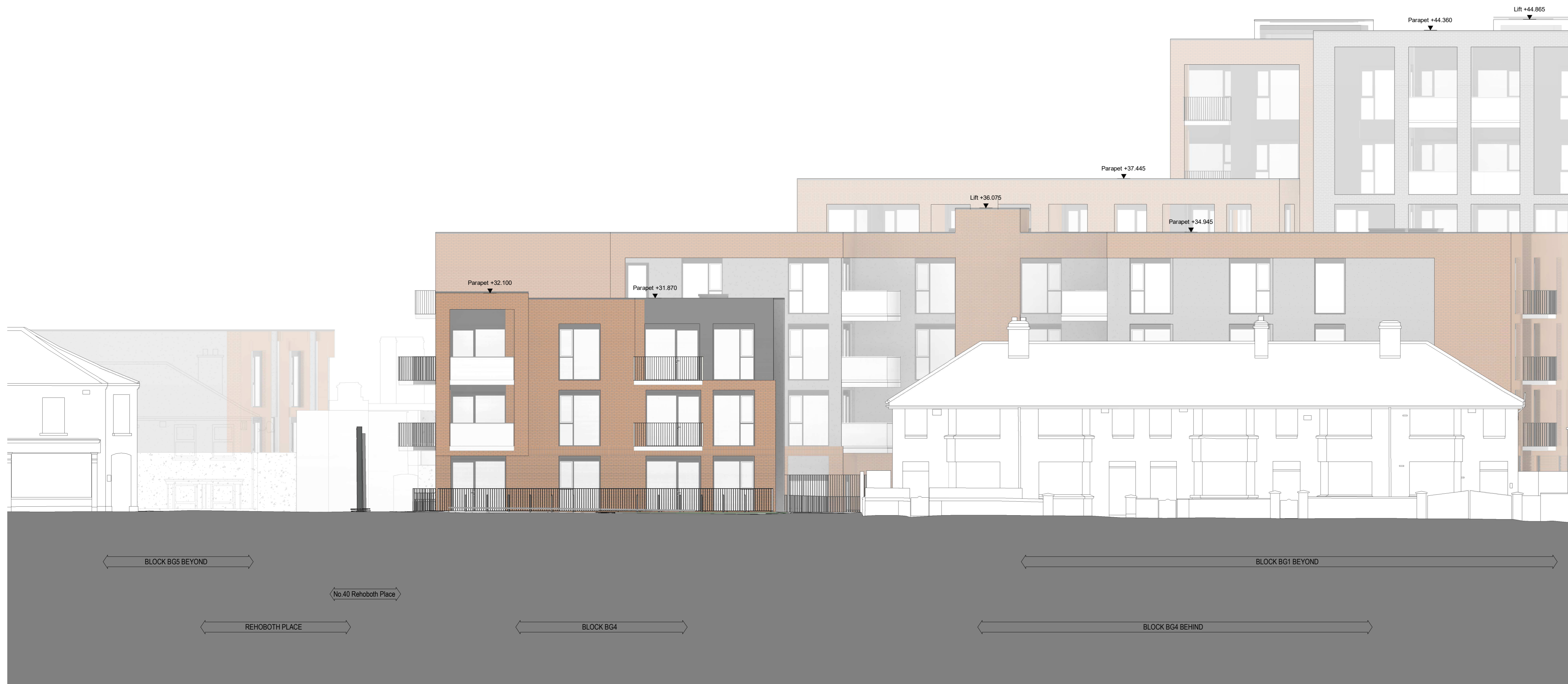
3 Contiguous Elevation 06 BG4-BG3 1 : 100